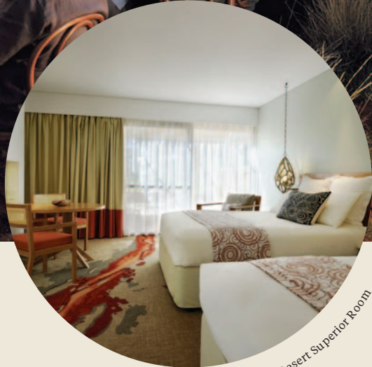
Sails in the Desert Superior Room