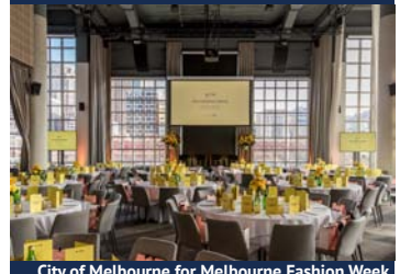
City of Melbourne for Melbourne Fashion Week

Let the view at Metropolis Events inspire you – experience the Metropolis difference today.