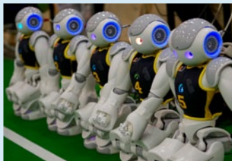
ABOVE: Some of UNSW's RoboCup robots.

It's not just fun and games - RoboCup has bold aspirations including, by 2050, fielding a team of "fully autonomous humanoid robots capable of defeating the World Cup-winning [football] squad in a match governed by FIFA's official rules".