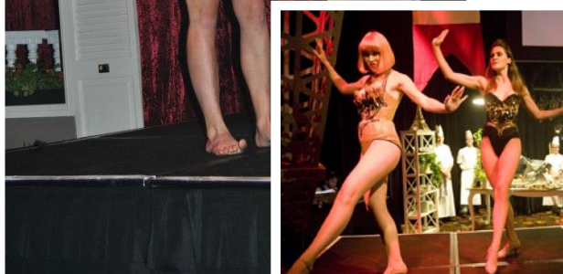
RIGHT: Guests loved being part of a fabulous fashion shoot.

The participants did not leave empty handed, being marked as VIPs on their departure via a gift of two Platinum Le Club Accorhotels luggage tags, presented in a little black box.