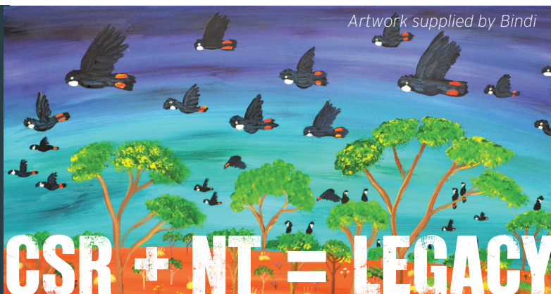
Artwork supplied by Bindi