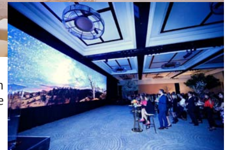
Pictured is the Four Seasons Hotel Sydney's new ballroom and, inset are attendees taking in the massive new 4K LED screen.

Guests at the event enjoyed wagyu scotch fillets, Sydney rock oysters and champagne.