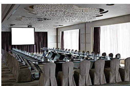
Star Room Langham Place, Mongkok, Hong Kong