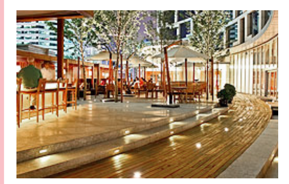
<mark>XTD Elevated</mark> The Langham, Xintiandi, Shanghai