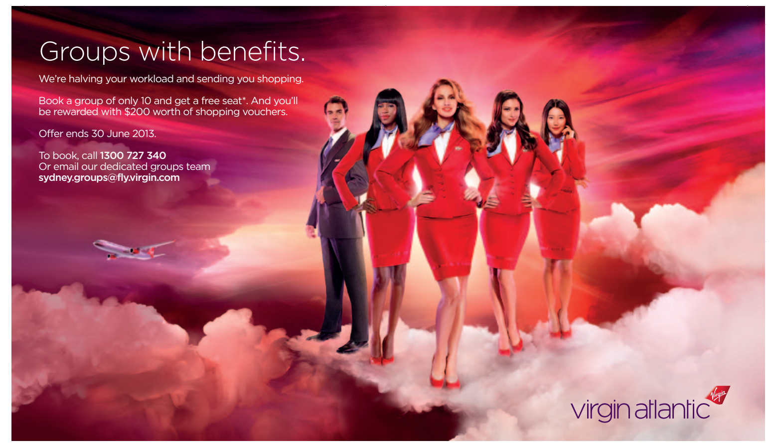
Terms and conditions apply. ^{\ast} Free seat applies to economy class group bookings only.

He moves from a London-based role with Raymond Gubbay Ltd.